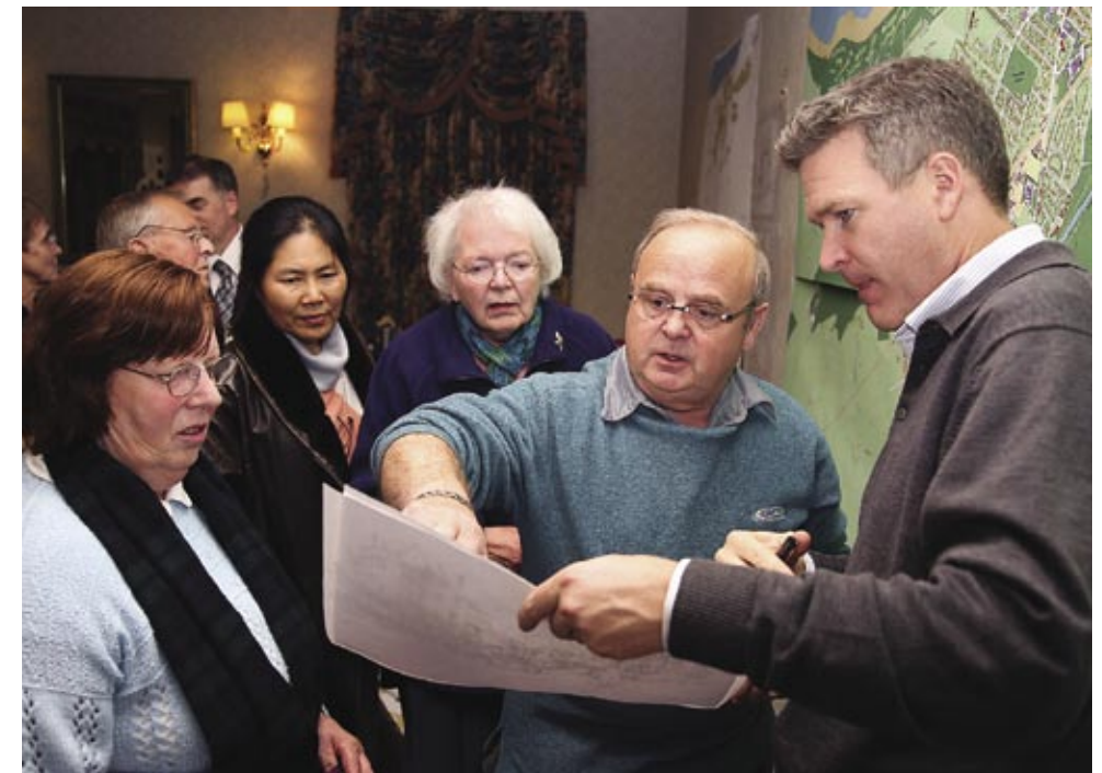
BELOW LEFT: AS THE EBD PROGRESSES, THE PROPOSALS ARE ILLUSTRATED BY ARTISTS (WHITENAP, 2008); BELOW: THE MASTERPLAN IS A SHARED VISION, RESULTING FROM ENERGETIC DISCUSSIONS WITHIN A WIDE STAKEHOLDER GROUP (NAIRN, 2008)