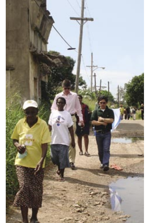
ABOVE: THE EBD PROCESS INCLUDES WALKED EXAMINATION OF THE DEVELOPMENT AREA (ROSE TOWN, JAMAICA, 2008)

The number of days for an EbD can vary as every site is different. However, it is normal for an EbD to run for five working days and to be preceded by preparatory sessions to explore key issues and familiarise key participants with the process ahead.