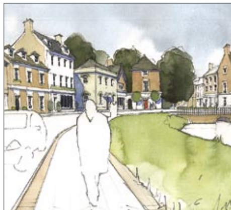
JAMIE SHARP 2008

At the close of the EbD, the product is a shared vision for the development site, which is illustrated in a series of plans, including an overall masterplan. This vision is shared by everyone linked to the development, including those responsible for granting planning permission. This makes quick delivery of the plan more achievable.